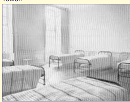
The Medical Centre bears little resemblance to the Sick Bay of the 1950's!

A new medical centre has been created in the old boiler room under the Bell Tower.